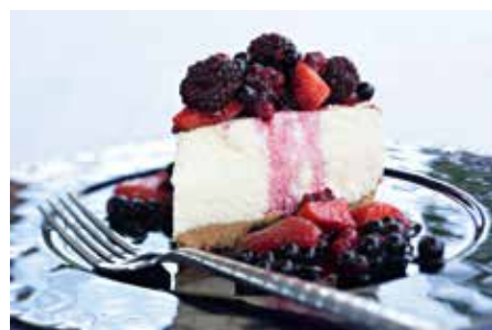
Turn off your camera's AF and try subtle movements back and forth until you achieve focus

I have achieved similar results to all the techniques mentioned here using just studio lighting, but somehow the pictures lacked the edge of realism required to convey home-cooked food. I still use a Canon EOS-1Ds Mark III, which I adore. I find the full-frame sensor ideal, especially when using the Canon TS-E 90mm f/2.8 lens. I try not to overuse its tilt-and-shift mechanism for effect, but it is really useful when controlling depth of field. We went through a very shallow depth of-field trend for a while, but I tend to shoot mostly around f/4.5 and, where necessary, I use the tilt to bring parts of the dish that are important into focus, such as the main ingredient and perhaps a garnish or an accompanying