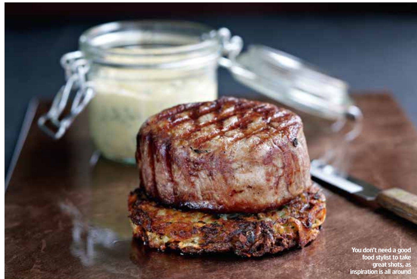
You don't need a good food stylist to take great shots, as inspiration is all around

'I once shot a bonfire-night-themed soup in June in a downstairs loo, complete with sparklers to get a long enough exposure'