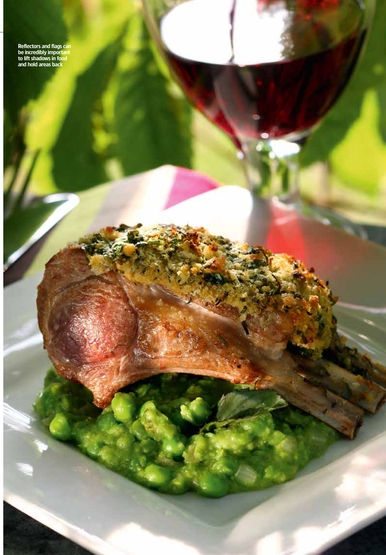
Reflectors and flags can be incredibly important to lift shadows in food and hold areas back

surfaces from junk shops, fabrics from curtain makers, period plates and cutlery from antique dealers, napkins from a supermarket – all can lift a shot. Unexpected colours work well too. I see a lot of blue props in contemporary food photography and I think it works well because so little food is naturally that colour.