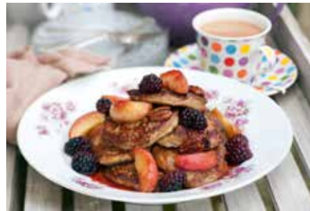
Keep an eye out for interesting backgrounds and props to enhance your shots

the apple painted with nail polish, or the ice cream made from Cadbury's Smash, so it stands to reason that as much as great ingredients produce great food, lovely pictures are easier to create of lovely food. If you can't wait to reach for the knife and fork, that means it will probably photograph well. Virtually all the food created is eaten during and at the end