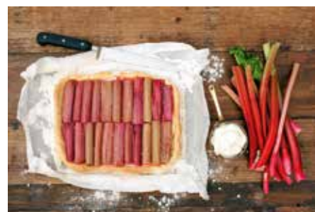
Taking a look straight down can work particularly well with flat foods, such as tarts and pizza

dish further back in the frame. I often shoot for editorial clients, so sometimes creating out-of-focus space in the frame pleases editors who like to overlay text. Another fine lens is the Canon 100mm f/2.8L Macro, which combines close focusing with a nice working distance and image stabilisation. I don't like using tripods and shoot handheld as much as I can before grabbing a monopod or tripod if light is fading. The usual rule about avoiding shake by using a shutter speed in excess of focal length applies more so with these lenses. I pride myself on a steady hand, but try to avoid slower