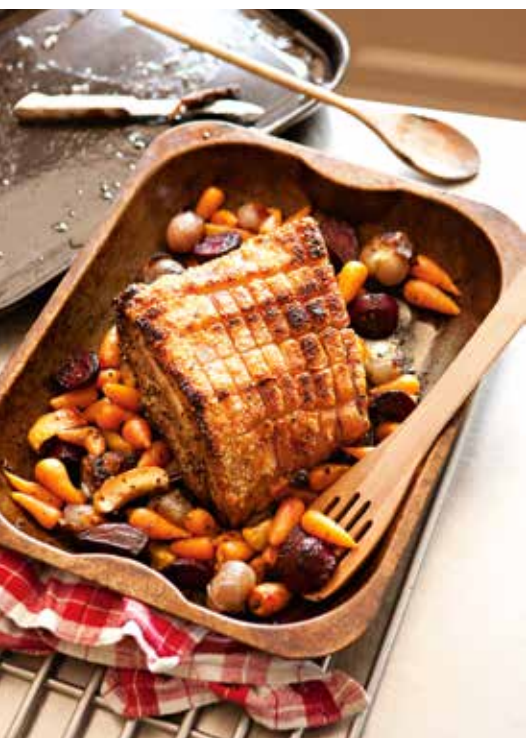
A 100mm macro lens is a great choice for food photography, offering a decent working distance

of the shoot. A talented chef and food stylist can make all the difference because, as well as having culinary skills, he or she is able to spot a potential problem on a plate when my brain is full of white balance and not whitebait. Rachel, who creates much of the food I photograph, has a hilarious skill for spotting rude shapes in food. She should have hosted That's Life .